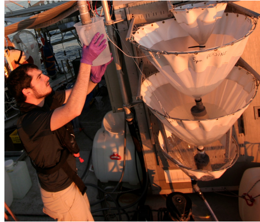
TaraPolarCircle-banquise-Tara behind ice

These recent developments still need to be refined, but they open the door to a holistic understanding of the oceanic ecosystem. It is crucial to integrate our most recent knowledge about oceanic plankton and the biogeochemical cycles taking place in the oceans with knowledge from various other disciplines (oceanography, meteorology, physics, etc...), to develop more accurate predictive models, and anticipate changes.